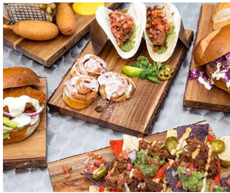
Salt Steakhouse ▼