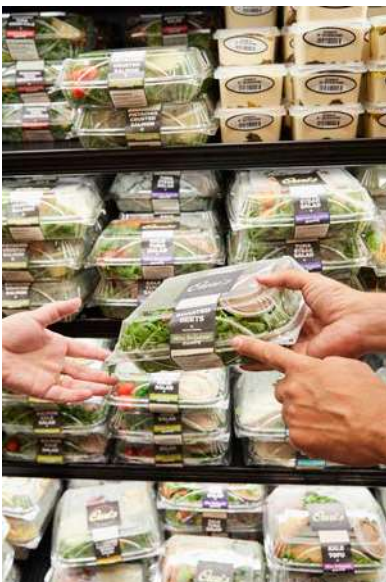
▼ Ouri's Market ►

250 Norwood Avenue, Deal, NJ (732) 531-6811